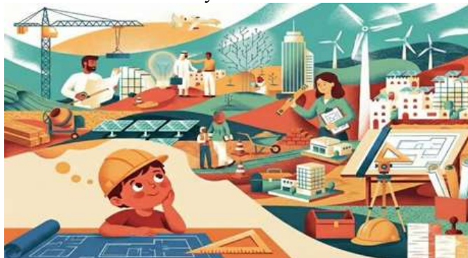
Figure 5. Mural Visual Concept Ideas