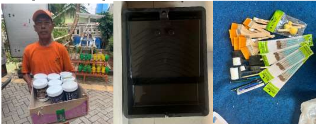
Figure 10. Paint and Paint Equipment

Before the implementation and realization of the mural paint design begins, the implementation team buys paint and paint equipment first. The paint chosen is avian interior brands for the reason that Cat Avian Brands is a paint brand that is classified as environmentally friendly and relatively affordable. Many of its products are water-based, low VOC (Volatile Organic Compounds), and have Green Label Singapore certification. Avian also achieved Green Proper from the Ministry of Environment and Forestry and green industry certification, demonstrating its commitment to reducing waste and hazardous materials. Then the implementation team buys paint equipment in the form of brushes, erasers, double tape, brushes, and paint tubs.