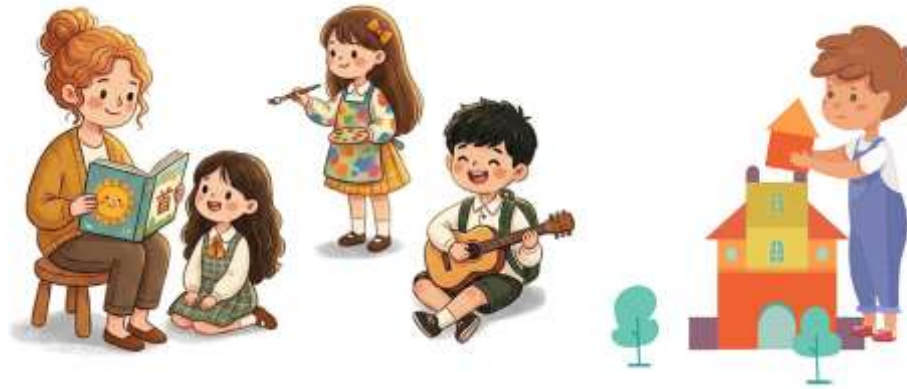
Figure 6. Alternative Mural Visual Concept Ideas

6. Carrying out Community Service activities is doing mural activities for a duration of 3 days with techniques as shown in the table below.