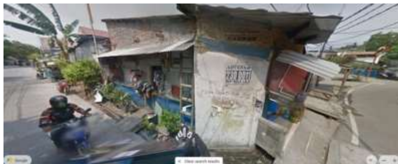
Figure 2. Densely Populated Neighborhood Around the North Rhino Rawa Area

PAUD Kartini is one of the institutions that has a high commitment to quality education, but is still limited in terms of learning support facilities. PAUD Kartini only has 1 classroom located on the 1st floor of the Rawa Badak Utara Village Office.