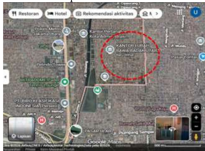
Figure 1. Location of PAUD Kartini

PAUD Kartini in North Jakarta is an early childhood education institution that provides educational services located in Rawa Badak Utara Village, North Jakarta where PAUD Kartini is quite active in various community activities.