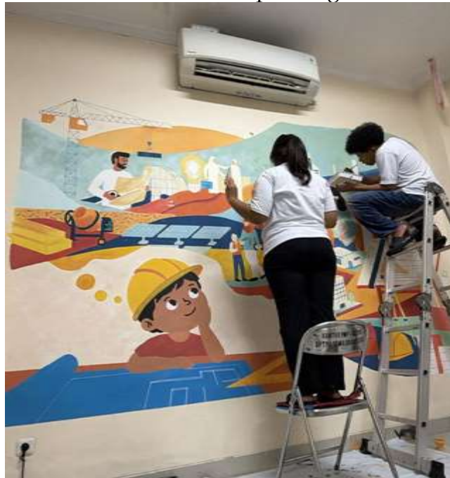
Figure 12. Sketching and Painting Process

The results of the mural on the wall of the PAUD classroom are as follows: