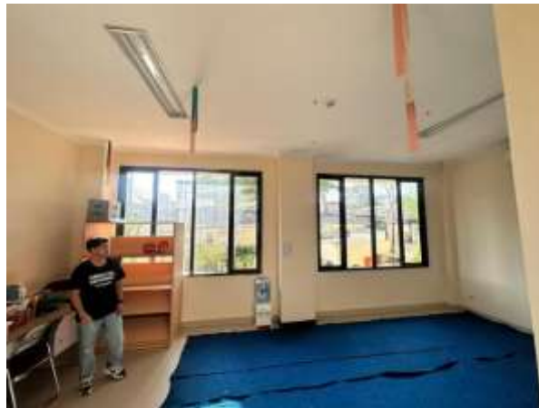
Figure 4. Interior of the Kartini Early Childhood Classroom

Direct factors such as the condition of the furniture that is directly related to the user, the condition of the spatial arrangement to the user, the visual factor of the space to the user