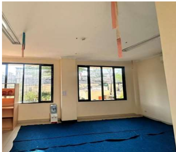
Figure 8. Existing Kartini PAUD Classroom

The team documented and re-measured the location of Kartini's PAUD classroom.