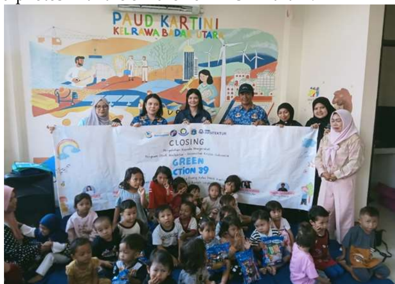
Figure 14. Photo with Kartini PAUD Children, along with the Village Head and Staff

After the drawing and painting of the mural was carried out in 4 days, the Implementation team closed the activity in the PAUD Classroom on Wednesday, June 17, 2026 at 09.00 WIB until it was completed. The closing activity was filled with remarks from the North Rawa Badak Village Head and the Head of the PkM team, the submission of plaques, souvenirs and certificates, the distribution of hampers and photos with the children of PAUD Kartini.