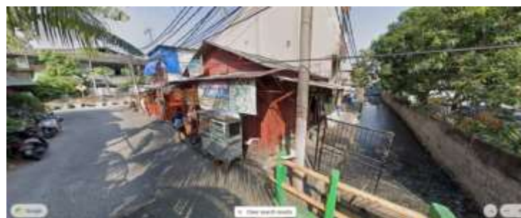
Figure 3. Densely Populated Neighborhood Around the North Rhino Rawa Area