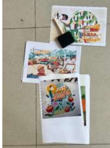
Figure 11. Print Out Some Sketches of Ideas