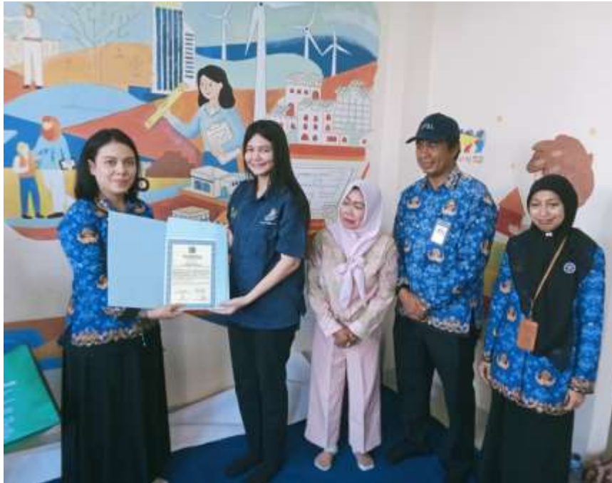
Figure 15. Awarding of Certificates given to the Implementation Team

As a form of appreciation to the PkM implementation team, the North Rawa Badak Village Village gave certificates of appreciation to the entire PkM implementation team.