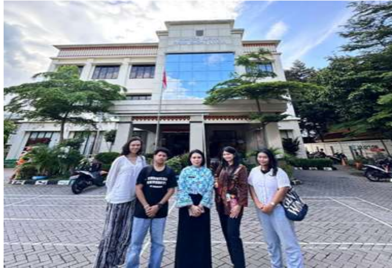
Figure 7. Photo with the Village Head After the Survey

Before carrying out the activity, the team conducted a survey first to the location of PAUD Kartini accompanied by the Village Head of Rawa Badak Utara Village.